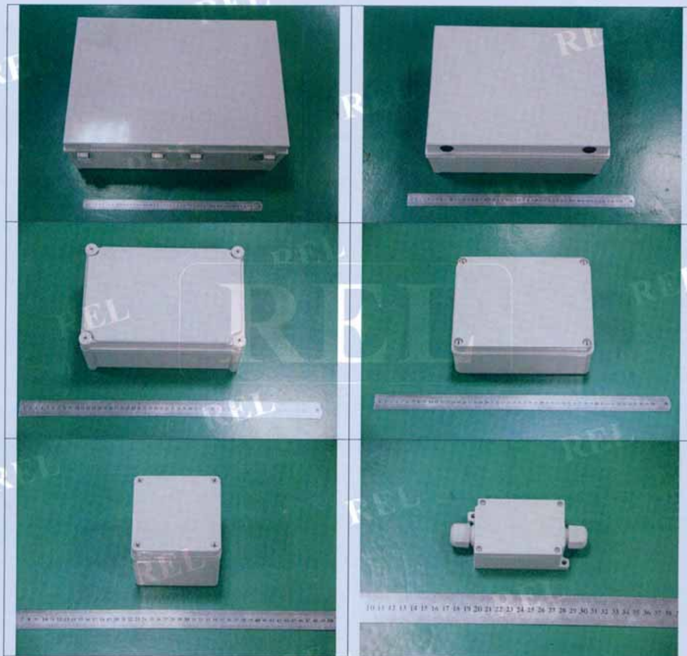
Fig.1. The representative appearance photos of the samples

The representative appearance photos of the samples before test were shown in Fig.1.