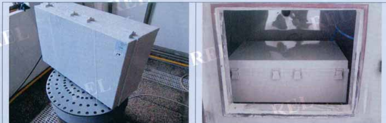
Fig.2. The photos of test process

The photos of test process were shown in Fig.2.